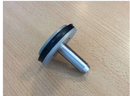
V2OS2SVA : Spring #105266 or #102.820.01